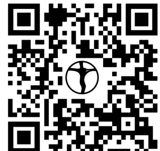
QR Code for Registration

New this year: there is not a separate registration fee if you have a preschooler and a K-8th grade student. Use the QR Code to register. If you have any questions, don't hesitate to contact the school office.